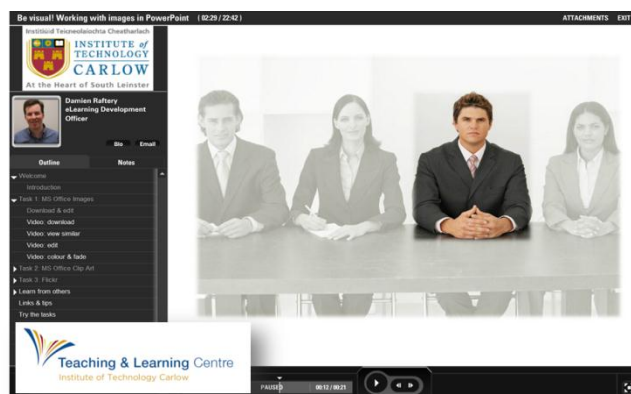
Be Visual! Working with Images in PowerPoint